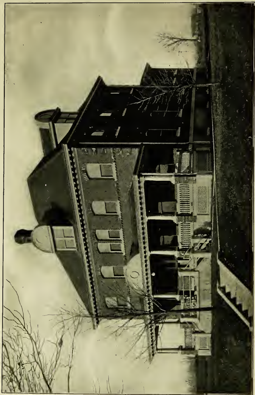
PATHOLOGICAL BUILDING AND MORGUE.